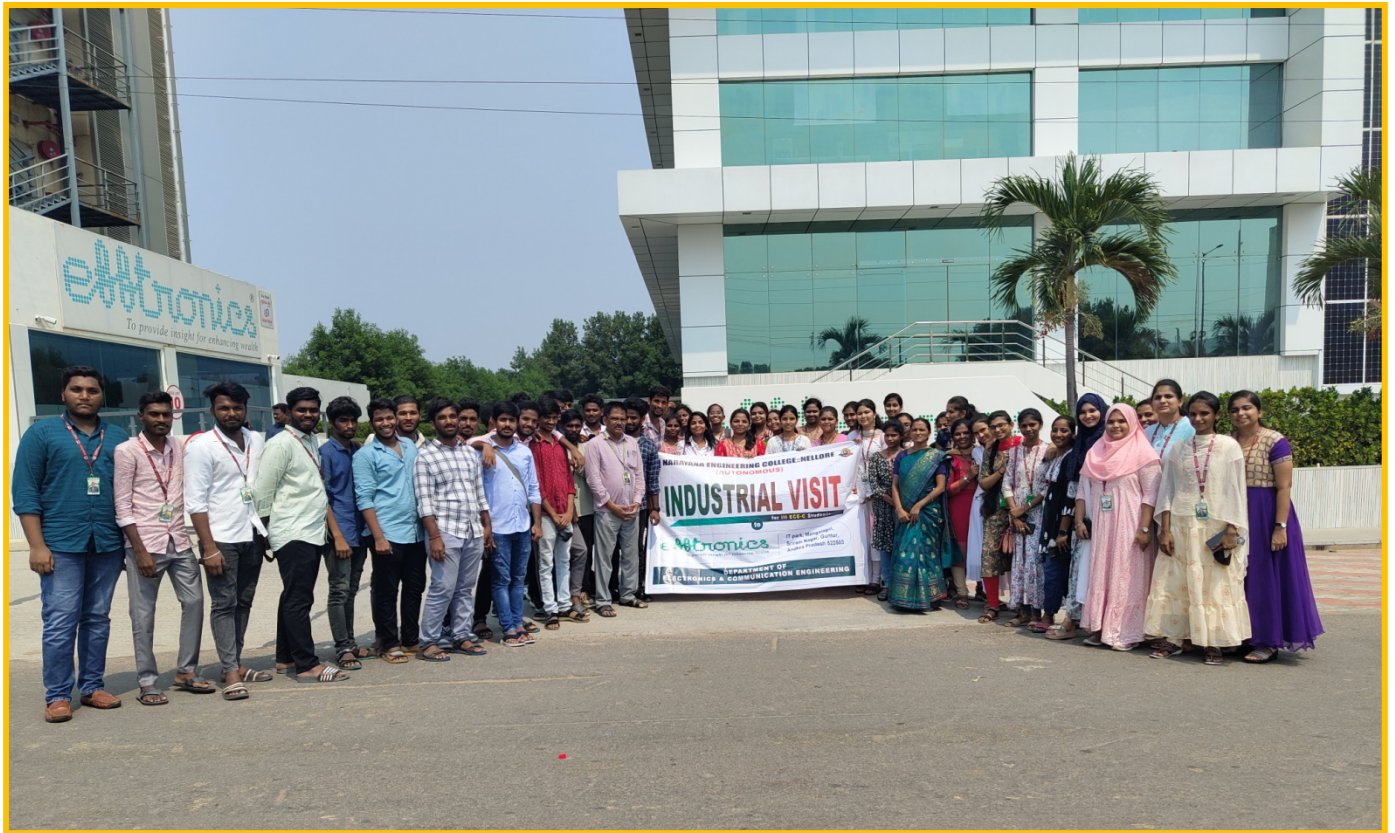
Group Photo @ Efftronics